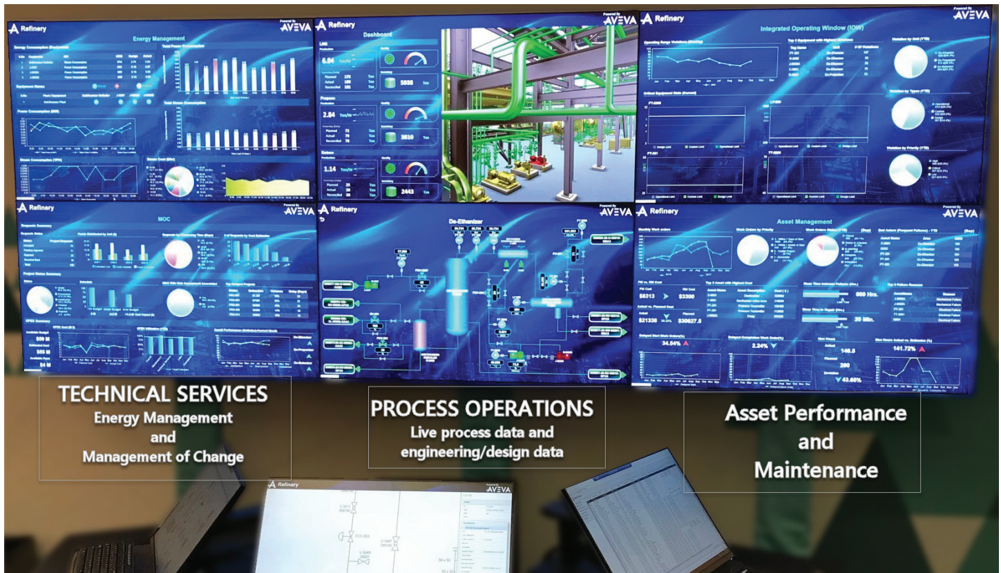
Integrated collaboration based on Unified Operations Center for O&G