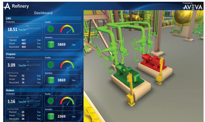
Unified Operations Center turns data into actionable information contextualizing 3D Engineering design with real-time Process data

The solution leverages existing data locked in enterprise and operational systems to enable “fact-based” decisions. AVEVA Unified Operations Center is based on a “Systems of Systems” approach. This means you can plug-in and integrate apps, predictive analytics, CCTV video, GIS maps, ERP systems,